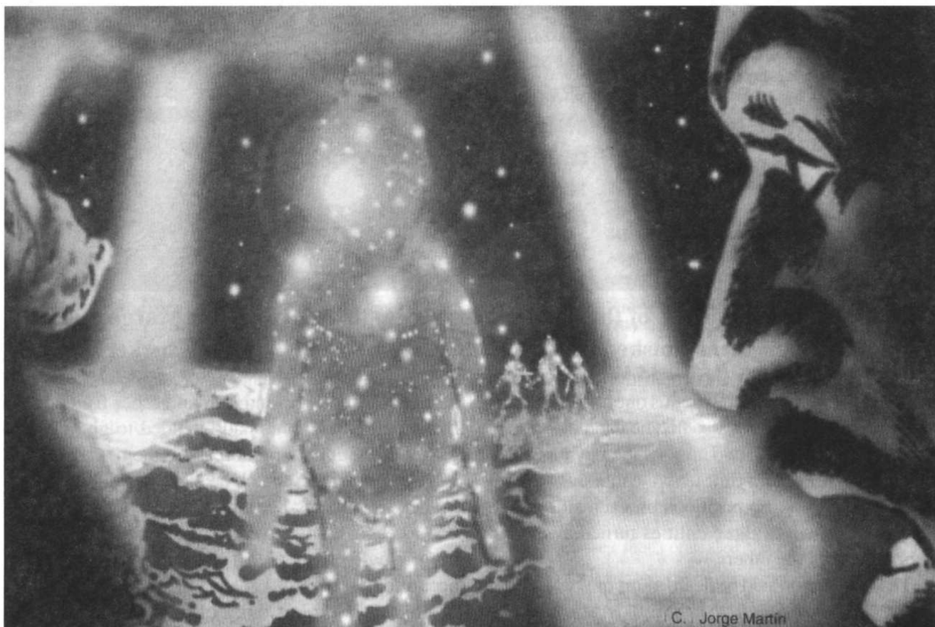
A little beyond the witness and the fantastic creature, there were several more, and in the sky was a luminous "cloud" that threw out beams of light.