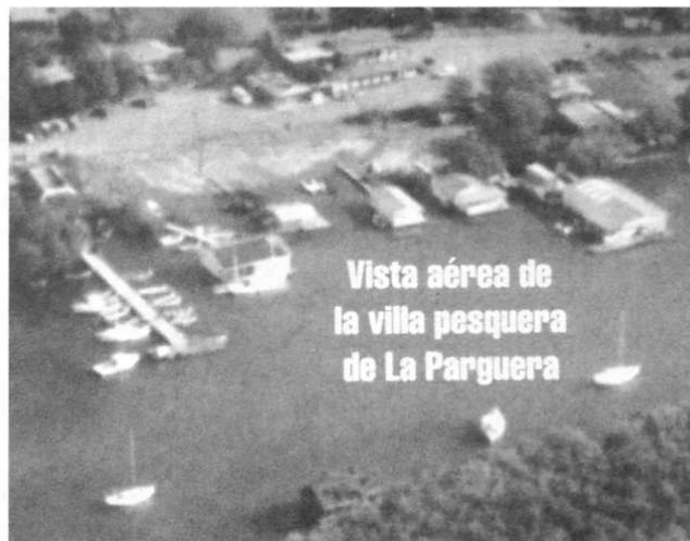
Aerial view of the fishing town of La Parguera.

All the time that this contact was in progress he was aware of the beam of light ("lightning" as he